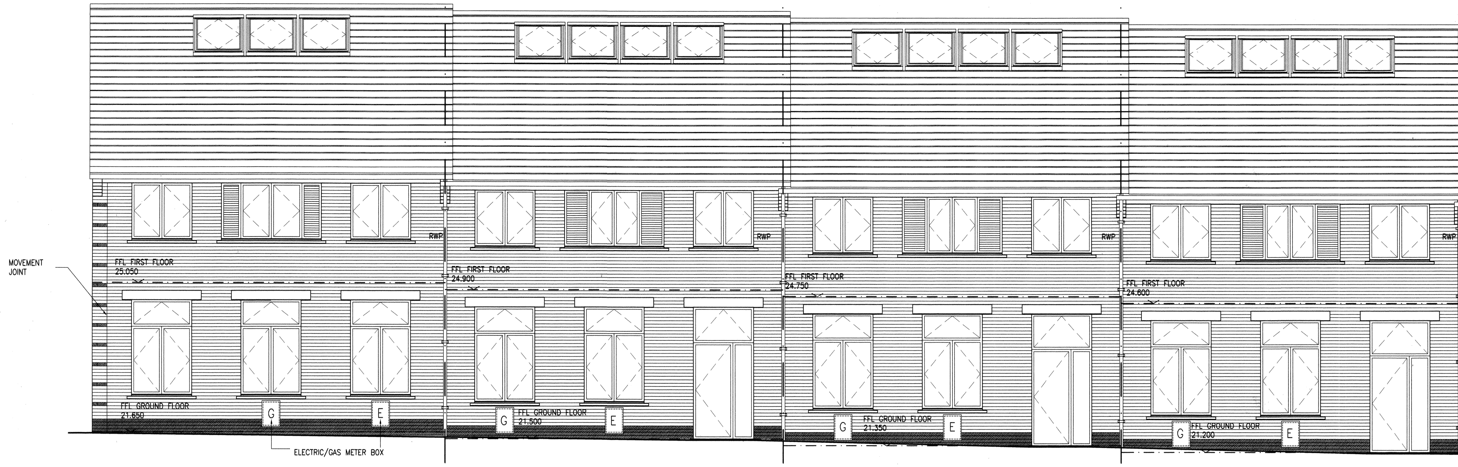
UNIT E – SOUTH ELEVATION SCALE 1:50