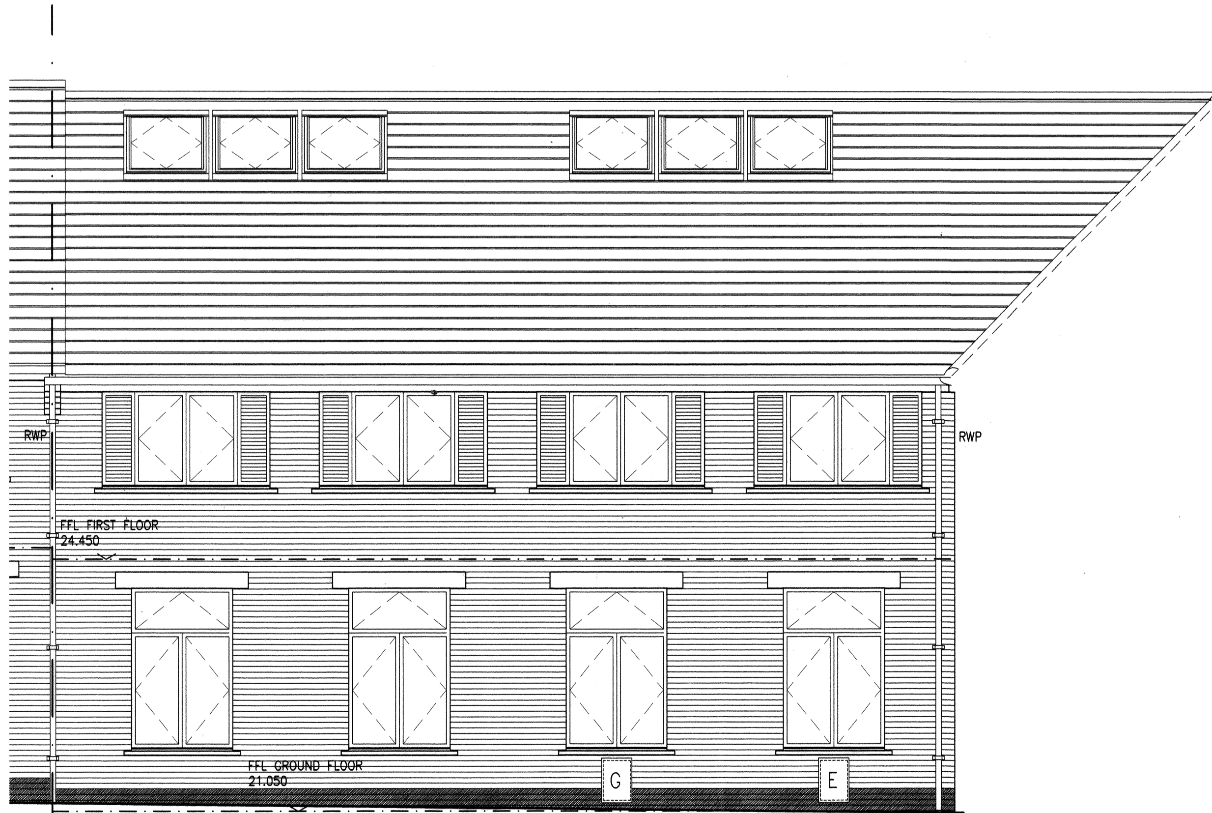
UNIT I – SOUTH ELEVATION SCALE 1:50