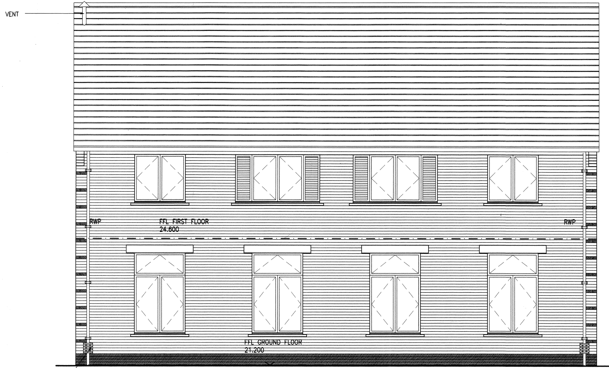
RAILINGS TO PROTECT RWP'S FROM CAR BUMPERS UNIT C – SOUTH ELEVATION SCALE 1:50