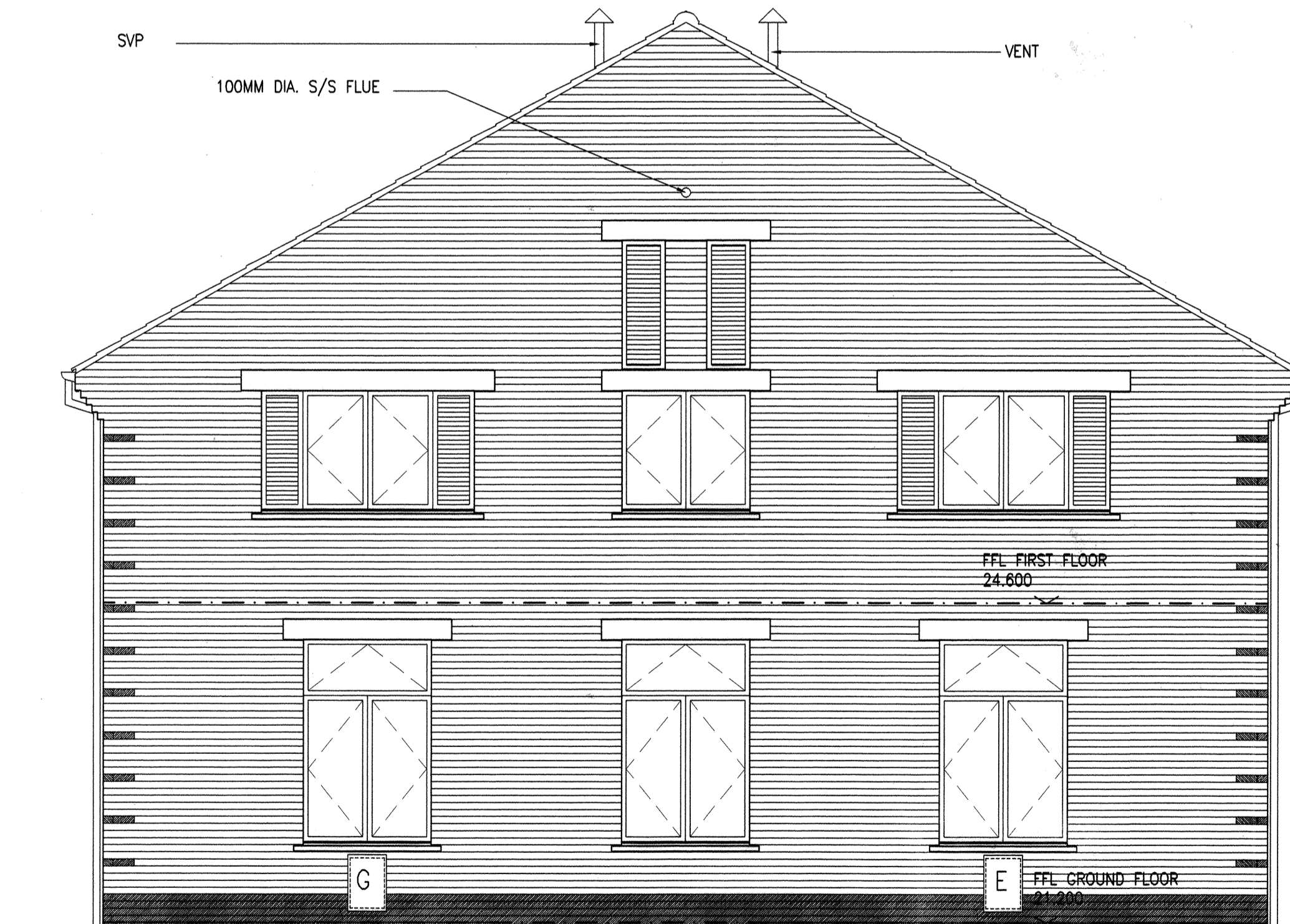
UNIT C – WEST ELEVATION SCALE 1:50

REVISIONS A. 24.11.2000 TJ WINDOW POSITIONS AMENDED. EAVES HEIGHT INCREASED. B. 01.12.2000 TJ ROOF WINDOW POSITIONS ALTERED. CORBEL DETAIL AMENDED. OPENING LIGHTS SHOWN ABOVE GLAS BLOCKS ON FIRST FLOOR. GAS AND ELECTRIC METER BOXES ADDED. C. 01.01.2001 TJ BRICK FEATURE PATTERNS ADDED. ROOF WINDOW POSITIONS AMENDED. D. 07.03.2001 KO'C BRICK PATTERN ADDED TO BUILDING CORNERS. SVP, FLUE, VENT, BELLPUSH, LETTERBOX, RAILINGS TO RWP'S, ANNOTATION TO GAS/ ELECTRICITY METERS.