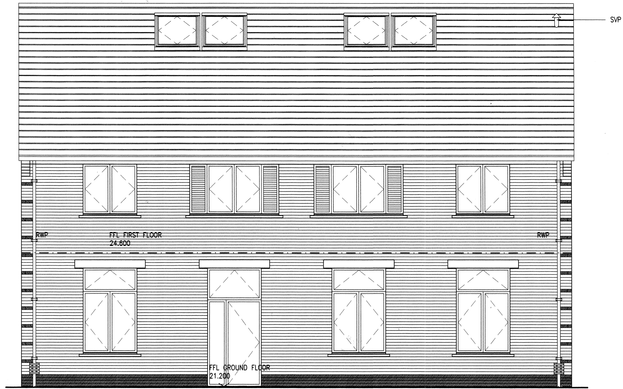
UNIT C – NORTH ELEVATION SCALE 1:50